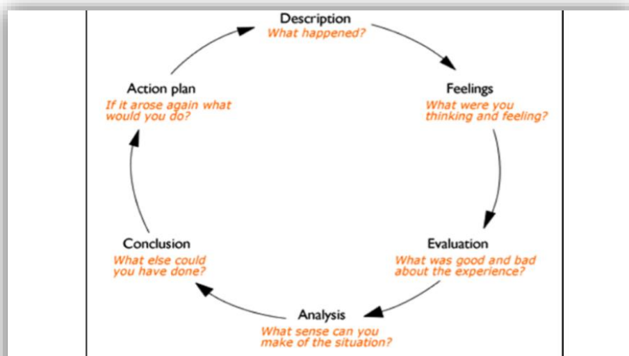
Figure 1: Debriefing sequence following an experiential cycle (Gibbs, 1988)