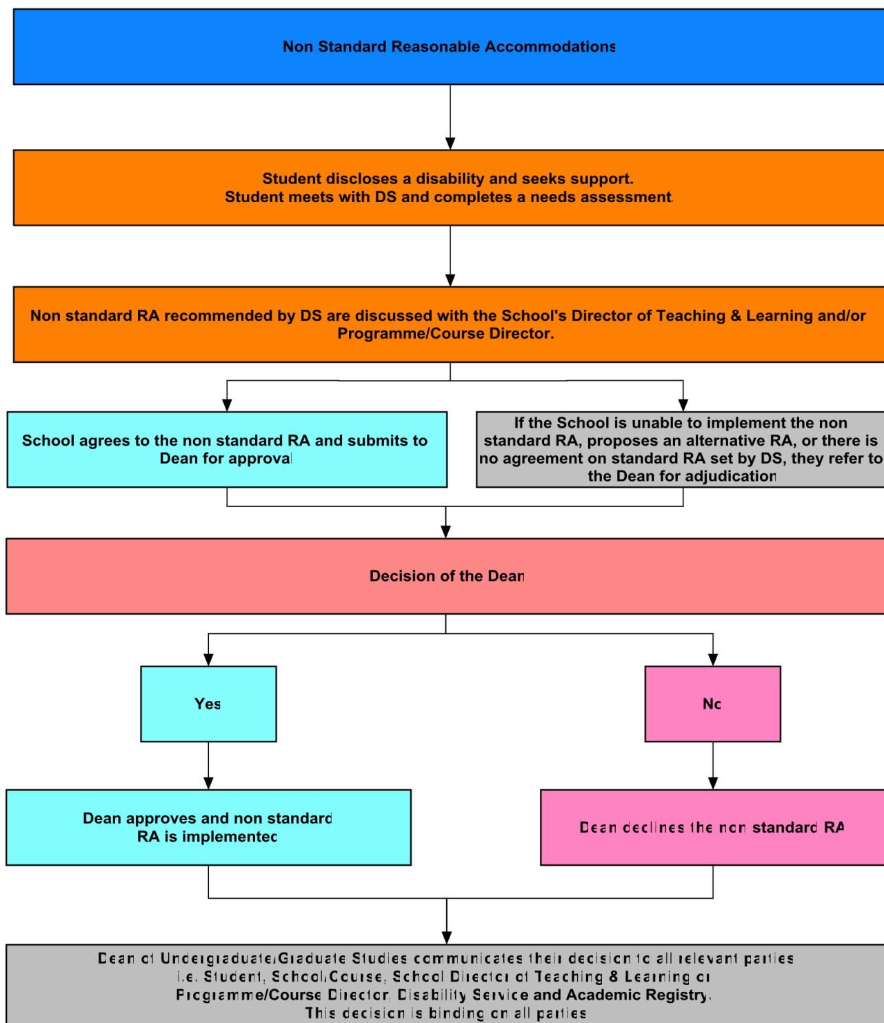
Diagram 2 - Non-standard Reasonable Accommodations approval process