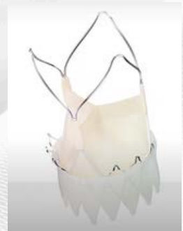
Boston Scientific Aortic Heart Valve