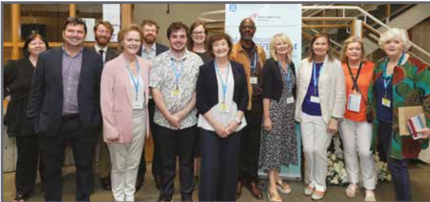
Many students and alumni were among the volunteers that assisted at the Congress of the European Society for Catholic Theology held in Trinity College Dublin in summer 2025.

at the intersection of the academy, the church, and the wider society, making a substantial contribution to debates about the role of faith in the contemporary world. At the same time, Loyola offers a unique focus upon the treasures of the Christian past, notably Celtic Christianity, with special attention to the theology of the Book of Kells. For more information on our activities, please look at our website or subscribe to our newsletter.